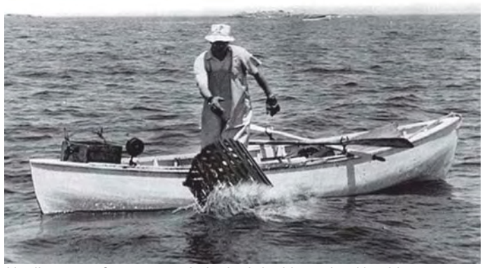
Hauling traps from a carvel planked double-ender.

The stems and their knees are guite hefty. I got mine out of some old construction grade fir that I salvaged from a dumpster. I first made thin plywood patterns from the lofting, and arranged them on the stock to best advantage, working around knots and other defects. The knee notches into the stem, and I glued this joint with epoxy. The two pieces were also bolted together with bronze carriage bolts, and the whole assembly was glued and bolted to the keel as well. This is where I stand now at this writing. I'll be cutting molds soon, and setting up for planking. Stay tuned for future installments!