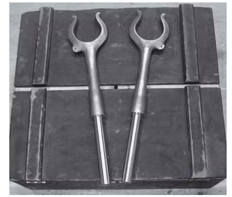
Cast bronze stand-up oarlocks from Duck Trap Woodworking.

provide a healthy range of secondary stability.