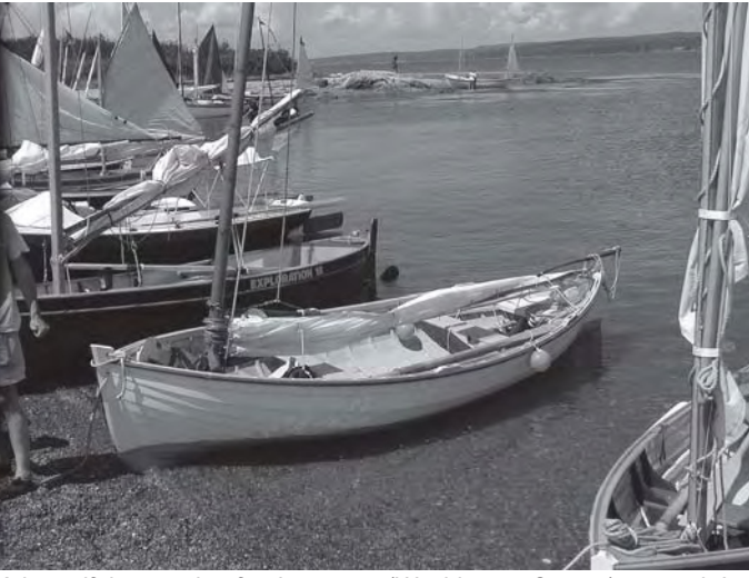
A beautiful example of a Jonesport (Washington County) peapod. I photographed this boat at the 2008 Small Reach Regatta. The owner, Charles Chamberlain, told me that this boat was built by the late Alan Vaitses, to lines found in Chapelle's American Small Sailing Craft, page 219 (fig. 83). She is gaff rigged with no centerboard.

garboard plank, and brings the backbone structure to a little less than 1-1/2" thick. This applied shoe creates the rabbet that would be chiseled in on the vertical keel. Once the keel has been laminated, its shape must be laid